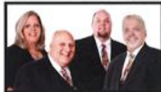
Common Bond Quartet Raceland, KY