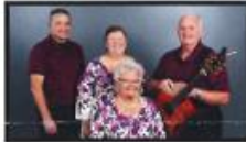
Voices of Peace Potter, WI