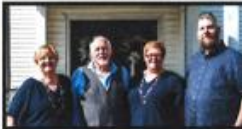
Loynachans Winterset, IA