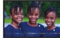
Foster Triplets Westmoreland, Jamaica