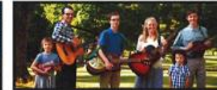
Bott Family Bluegrass Nashotah, WI