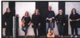
SaltLight Waverly, IA