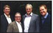
Skylight Quartet Grand Rapids, MI