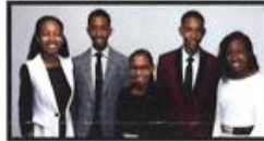
The Chitans Odon, IN